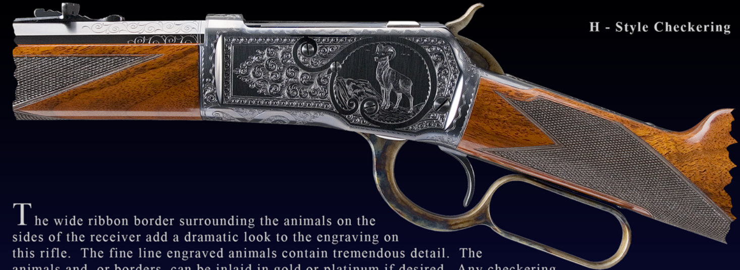
H - Style Checkering

The wide ribbon border surrounding the animals on the sides of the receiver add a dramatic look to the engraving on this rifle. The fine line engraved animals contain tremendous detail. The animals and, or borders, can be inlaid in gold or platinum if desired. Any checkering pattern shown on page 22 can be furnished. In addition, any vignette shown on page 23 may be substituted on the sides of the receiver. The ribbon borders may be modified to suit changes in the vignetted scenes. This style of engraving and ornamentation can be applied to all Winchester rifles.