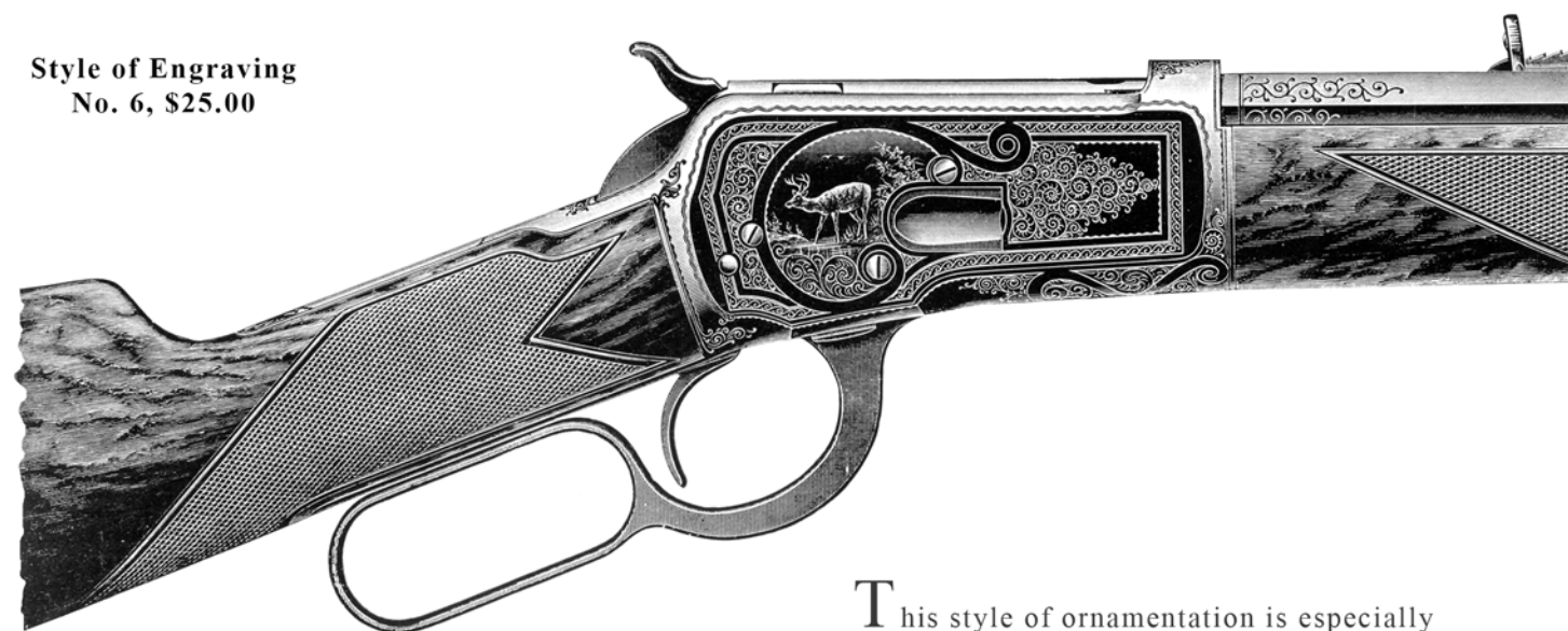
Style of Engraving No. 6, $25.00

This style of ornamentation is especially recommended, furnishing an attractive finish at a moderate price. It embraces scroll, border, line and ribbon engraving. The receiver is profusely engraved on the sides with scroll and on the under part with ribbon work. The scenes are outline engraving and surrounded with scroll frames.